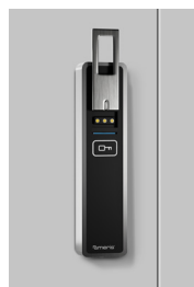
E-Lock Mini RFID Square Front