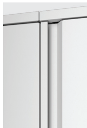
A - Full Pull

When specifying E-lock Mini or E-Lock RFID, Programming and Managers Keys are required to operate these locks. See page 57 of the pricebook online to order these key management accessories.