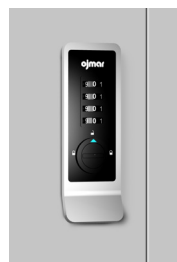
Mechanical Square Front