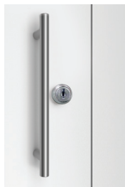
Q – Bar Pull