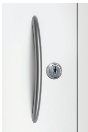
S – Satin Nickel Loop Pull

When specifying E-lock Mini or E-Lock RFID, Programming and Managers Keys are required to operate these locks. See page 57 of the pricebook online to order these key management accessories.