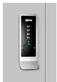
Mechanical Square Front